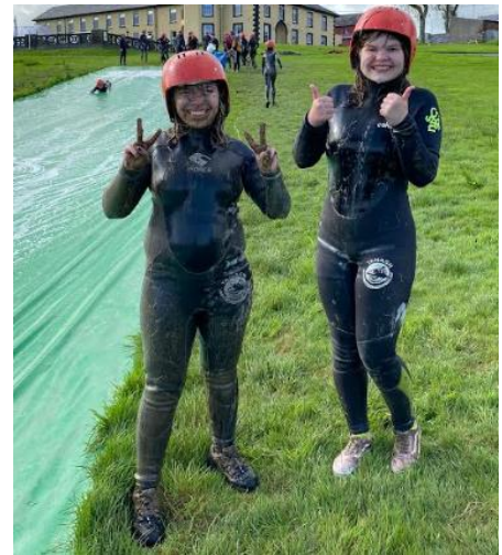
The transition year students had a very enjoyable time on their bonding trip in Tanagh Adventure Centre. The various activities included canoeing, rock climbing, mud slides and battle zone archery.